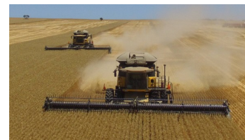
Marco & Simon mowing the last of the wheat at ground level

The weather laid the last of our wheat even lower, which meant harvesting it at ground level was the only option. With such heavy rain, a lot of the wheat has begun to germinate in the head. The sprouted grain requires the bulk handlers to do a falling numbers test on the wheat. This tests the strength of the wheat when it is milled into flour and determines whether it can be still used for flour production or if it is reduced to a feed grade product. The falling numbers test can take up to six minutes per sample, which increases the work for the grain classifiers at the silos and adds more waiting time for the truck drivers. Thankfully, most of our wheat was still hard milling grade but some was reduced to a lower grade milling wheat, which was still a good outcome.