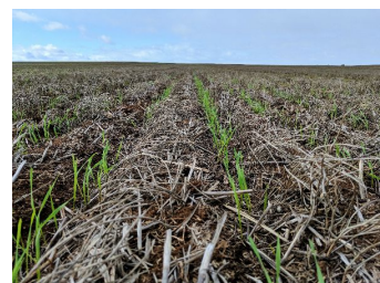
Wheat coming up in lentil stubble