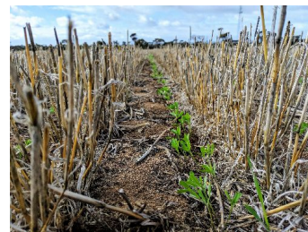
Lentils emerging between the stubble rows at Ardrossan

We have started spreading urea on our early-sown barley crops and will begin some applications of herbicide next week to take some weeds out of some lentils. There is also plenty of rolling to do to push under the stones in the barley paddock that will be windrowed.