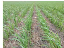
Scepter wheat, suffering moisture stress, is thinner than normal due to dry conditions