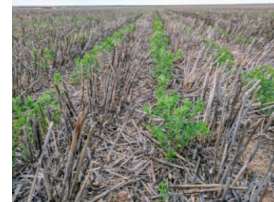
Hurricane lentils near Price, surviving on virtually no rain since April

We often have groups visit us during the year.