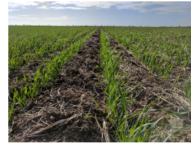
Trojan wheat sown in to lenticular stubble

Some farmers have chosen to delay seeding until it rains. Others have pulled up halfway through and some (like