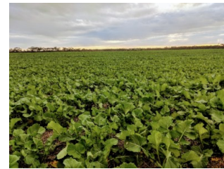
Canola at Maitland looking good with no waterlogging