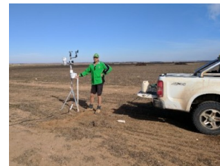
Soil moisture probes & weather stations providing valuable data

Last week, nine of our staff members attended first aid training locally at Regional Skills Training, where we were trained by an experienced paramedic. Everyone really enjoyed the day and learned a lot.