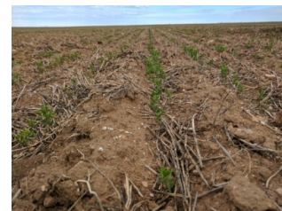
Lentils at Price struggling with 85 mm of rain