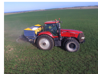
Danny spreading Grenade wheat near Ardrossan