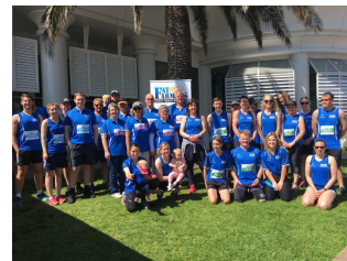
Yorke Fat Farmers City to Bay 2017