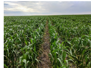
Wheat at Point Pearce hanging in there with 120 mm of rain

In South Australia, our weather pattern continues to be dominated by blocking high pressure systems with a lot of the rainfall being pushed to the south. Locally, our situation is not as desperate as many other areas in SA. We are certainly a lot better off than areas in the eastern states as many farmers are enduring catastrophic drought conditions. So far, Maitland has received 175mm (7 inches) which is 50% of its average annual rain. The east coast of the peninsula is 70% below average, having received only 85mm at Price and 100mm (4 inches) at Ardrossan.